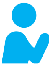
People with underlying medical conditions

Chronic liver disease Cancer Cardiovascular illness etc.