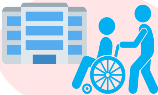
Medical institutions and nursing homes